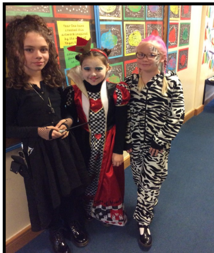
Some of our Year 6 girls dressing to impress!

I'm sure there will be more challenges ahead but for now we have a well deserved and needed break and the staff at Woodstone would like to wish you and your families a lovely Christmas.