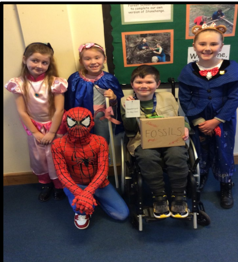
Our Year 4 children certainly played their part in Children in Need.

CHILDREN IN NEED— It's always important to help other people and many of the causes in this year's Children in Need were extremely emotive and I need of support.