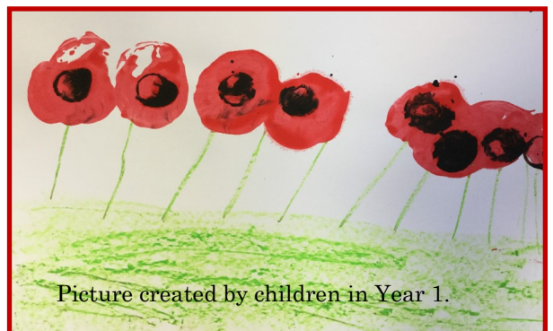
Picture created by children in Year 1.