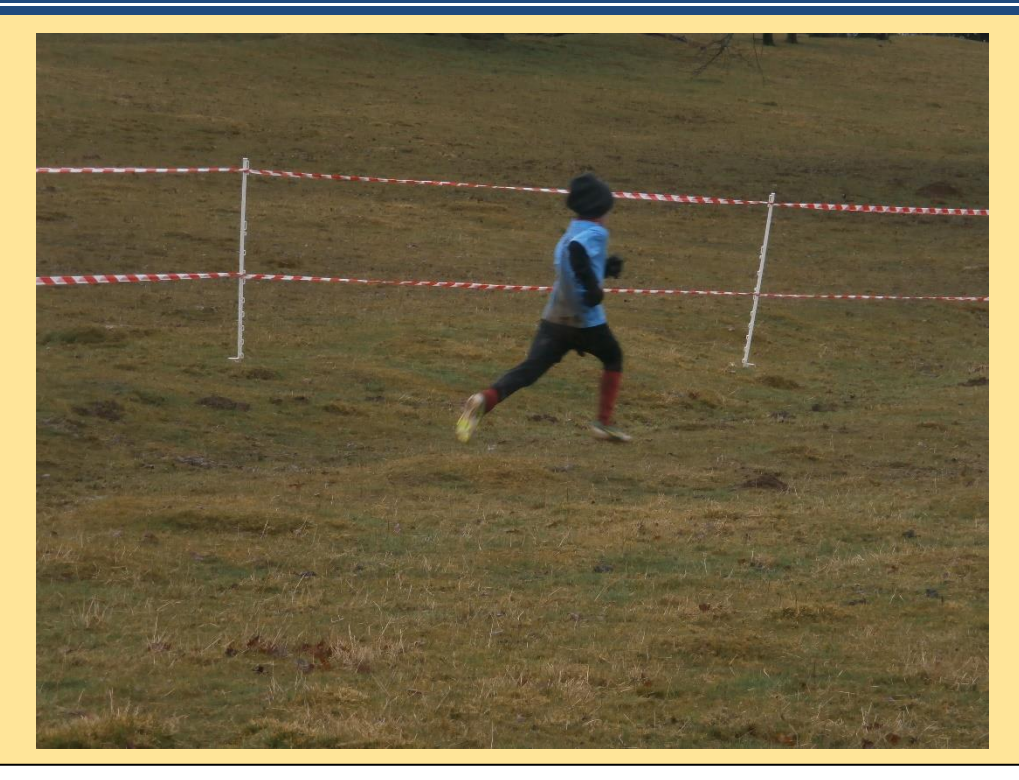
'Children get a chance to shine both academically and physically'