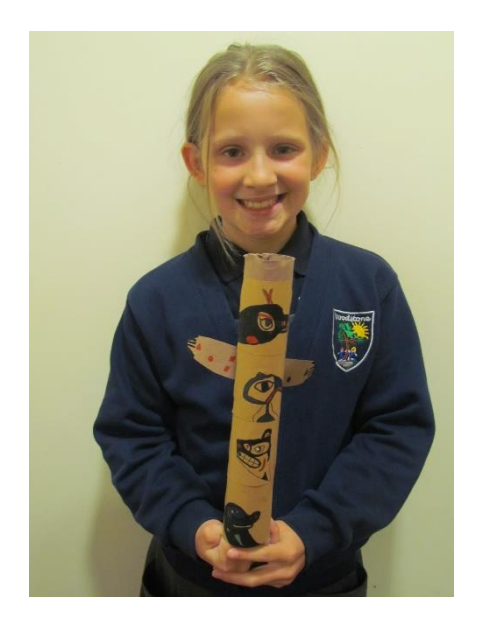
As part of our studies on North America, we had fun designing and making totem poles.