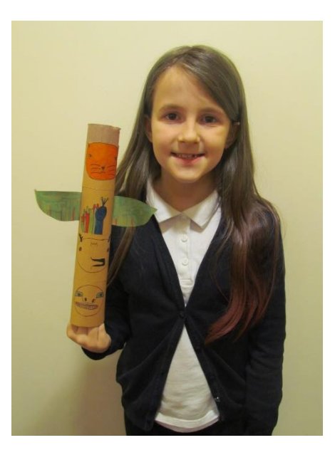
The carvings were mostly of animals with each one representing different valued characteristics.