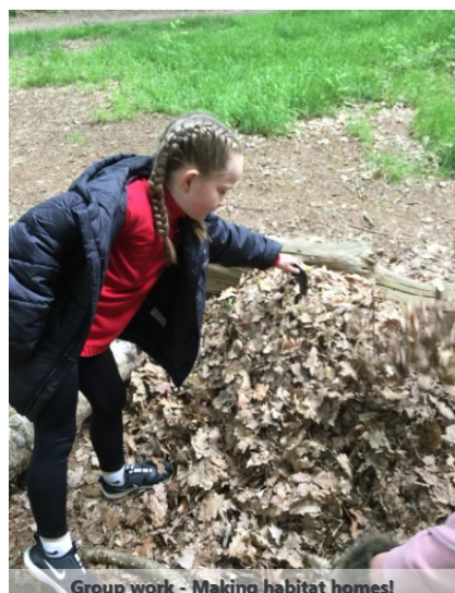
Group work - Making habitat homes!

Residential visits are an important part of a child's social and emotional development and here at Woodstone we like to offer our children a range of opportunities. Just last week we took two trips—the Year 6 children to Christchurch near Bournemouth and our Year 2 children to Sherwood Forest. The Year 6 children did a range of activities including canoeing, paddle boarding, axe throwing, laser tagging and bushcraft whilst our Year 2 children enjoyed a day of activities in the Forest, a visit to Robin Hood's tree (the Major Oak) and a full day at Wheelgate Park.