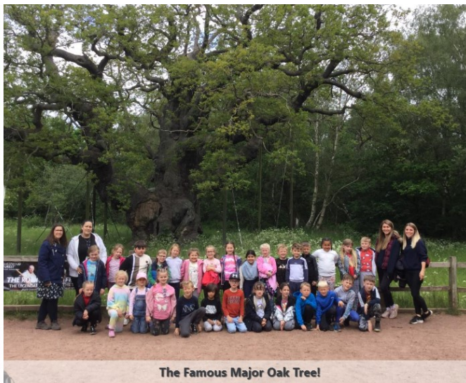
The Famous Major Oak Tree!

Have a look in the Gallery section of the website to see more photos from the Year 6 trip to Bournemouth. To see & read more about the Year 2 trip, visit the Year 2 class page and look in the tab called 'Year 2 Class News'.