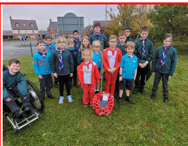
Laying our own wreath at our memorial oak