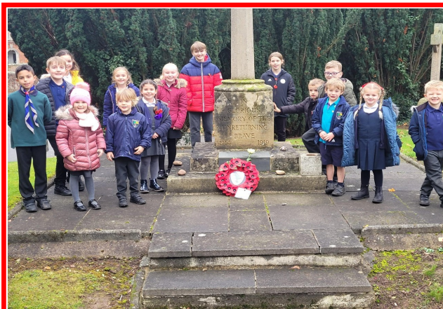
Laying our wreath at the Ravenstone war memorial